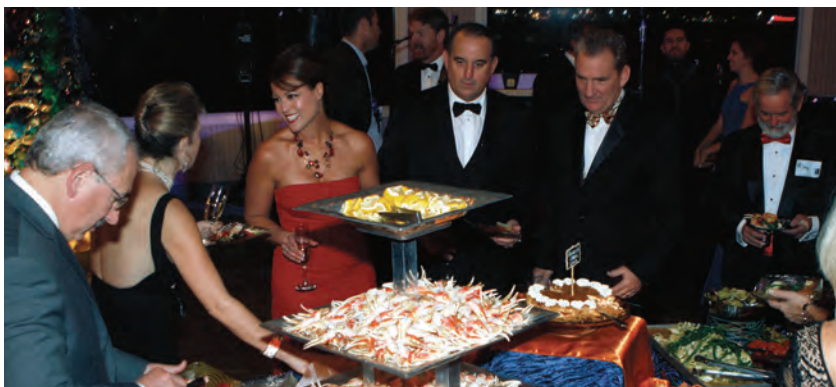
Guests enjoy a strolling reception featuring an oyster bar, with hosted wine and cocktails.