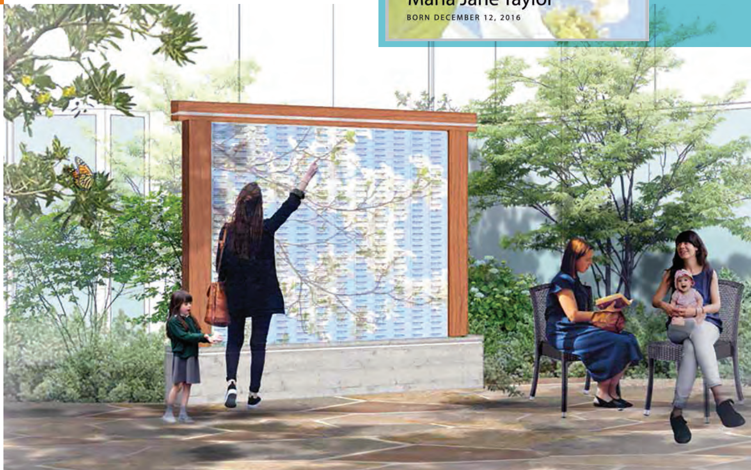
Dr. Joseph T. Anzalone Family & Newborn Care Courtyard