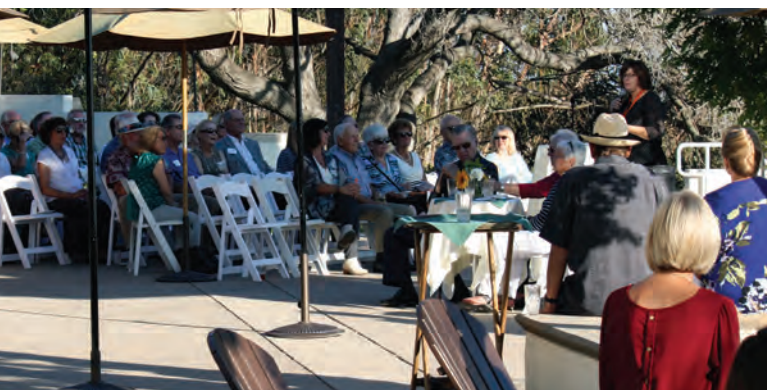
More than 120 significant contributors, sponsors, and board members attended the event.

meditation—all of which are now offered at Dominican Hospital. Thank you again to everyone who supports Dominican in providing the best possible care to Santa Cruz County.