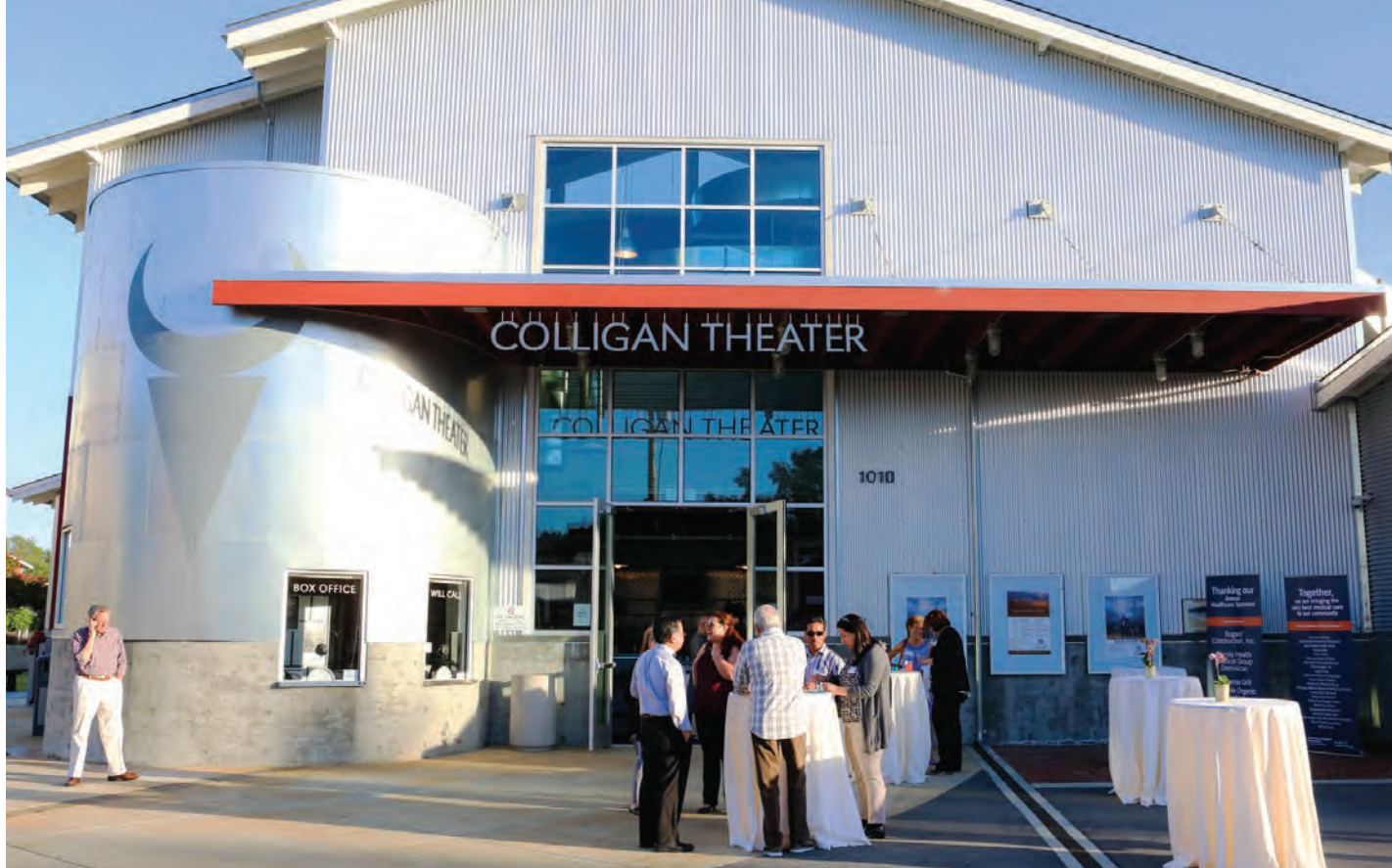
Physicians Pteron Society members and their guests enjoy a reception before a dress rehearsal performance at the Colligan Theater.